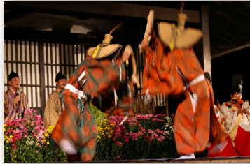
• The oldest folksong in Japan “Kokiriko” Performance at Kaminashi Area

Gokayama is a treasure land of folk songs. Enjoy and experience traditional Japanese dance! Check out the schedule at the website below! https://gokayama-info.jp/en