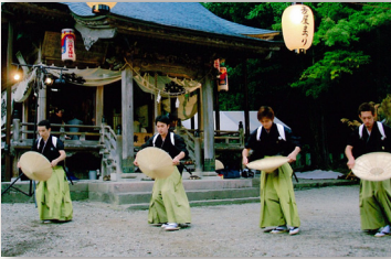
• The nostalgic samurai dance “Mugiyabushi” Performance at Shimonashi Area