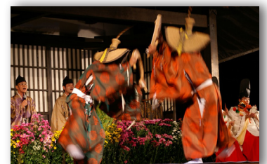
• The oldest folksong in Japan "Kokiriko" Performance at Kaminashi Area

Gokayama is a treasure land of folk songs. Enjoy and experience traditional Japanese dance! Check out the schedule at the website below! http://www.gokayama-info.jp/en