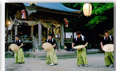
• The nostalgic samurai dance "Mugiyabushi" Performance at Shimonashi Area